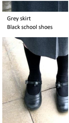
Grey skirt Black school shoes