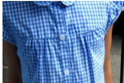
Blue summer dress