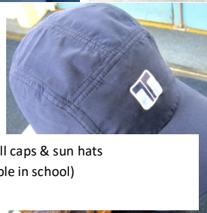
Baseball caps & sun hats (available in school)