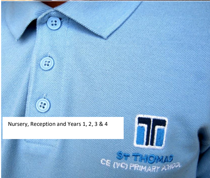
Nursery, Reception and Years 1, 2, 3 & 4

PE KIT T-shirt in house colour (see uniform leaflet), black shorts, white socks and black pumps