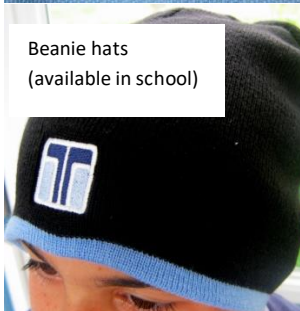
Beanie hats (available in school)