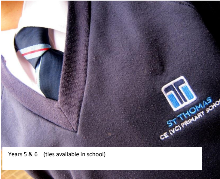
Years 5 & 6 (ties available in school)