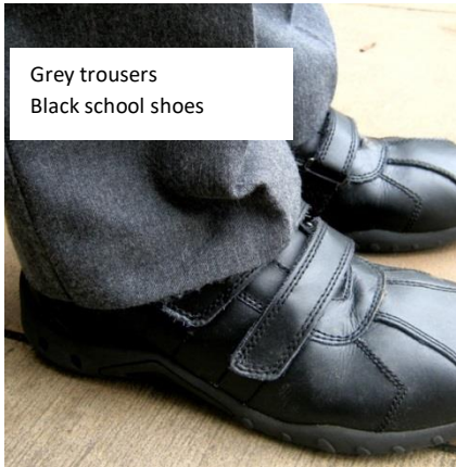
Grey trousers Black school shoes