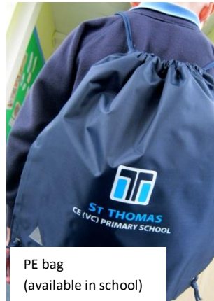
PE bag (available in school)